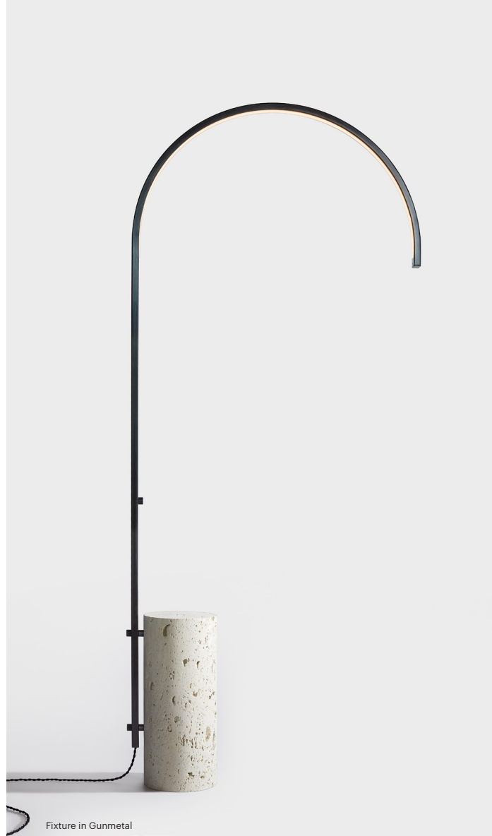
Fixture in Gunmetal